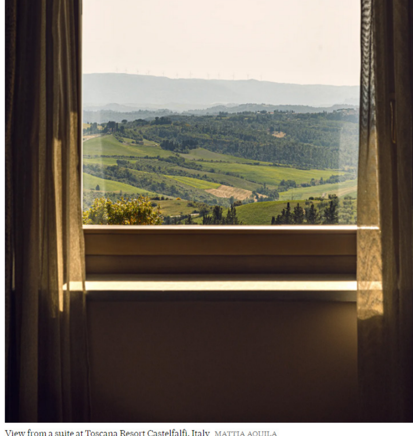
View from a suite at Toscana Resort Castelfalfi, Italy MATTIA AQUILA

Nothing is too much trouble, from the waiters who do their utmost to ensure a front row seat on the terrace at breakfast to the reception staff who will lend mosquito spray if you've forgotten to bring your own.