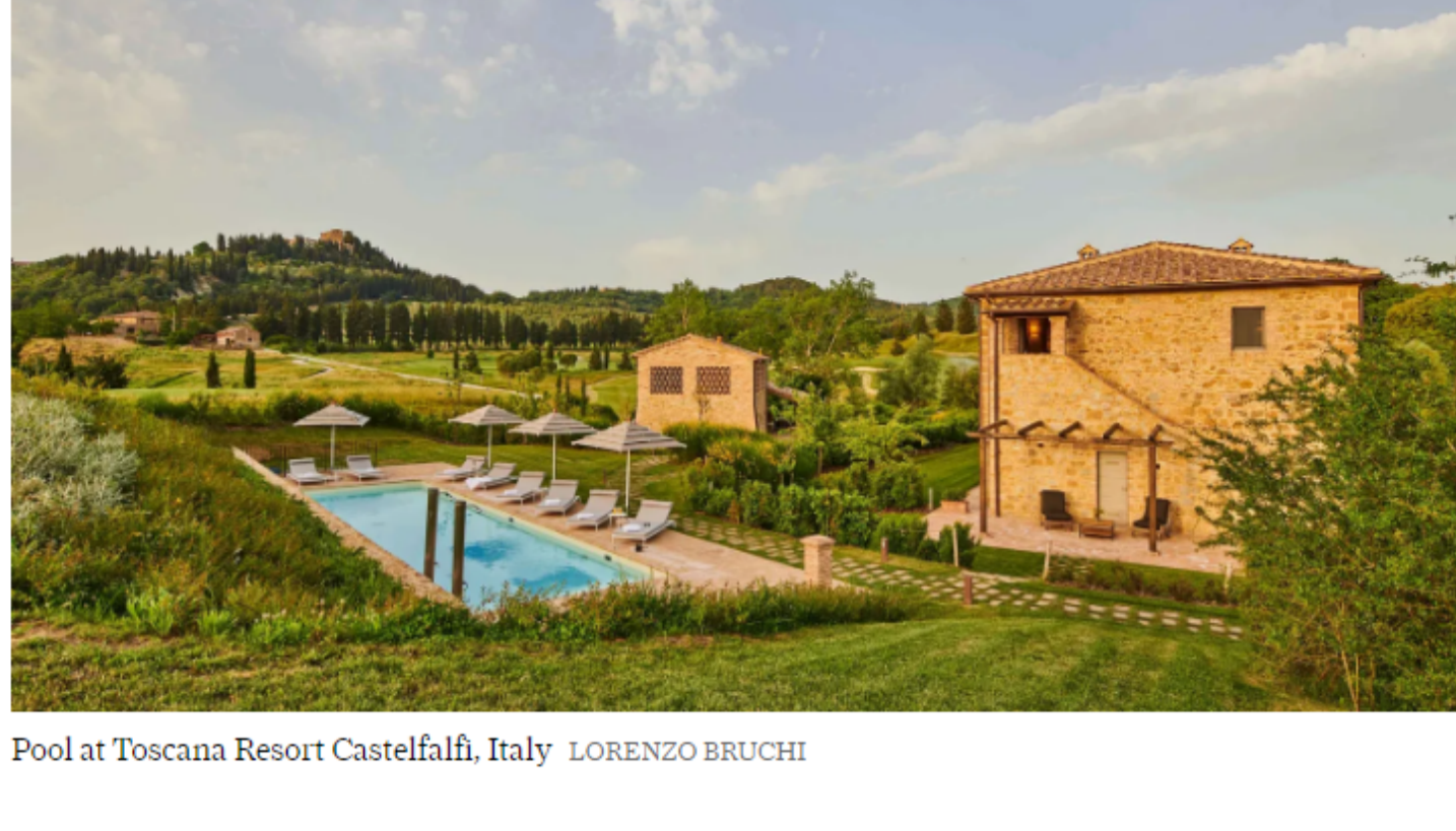
Pool at Toscana Resort Castelfalfi, Italy LORENZO BRUCHI

A 50-minute drive from both Pisa and Florence, Toscana Resort Castelfalfi is a 1,100-hectare working estate complete with vineyards, olive groves, a borgo (village) where residents live all year round, a hotel and a golf course. It occupies around 20 per cent of the town of Montañione, so locals might pop by for supper in the trattoria, for aperitivi on the Ecrú bar terrace or a few rounds of golf.