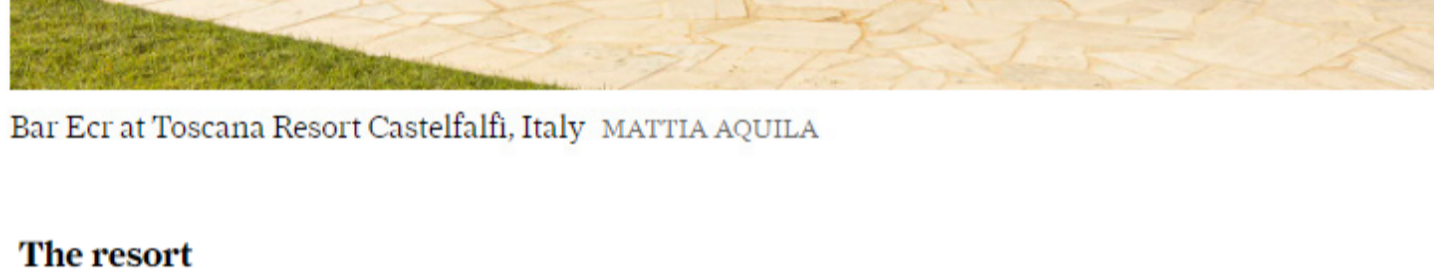
Bar Ecrú at Toscana Resort Castelfalfi, Italy MATTIA AQUILA

The spa set-up is comprehensive, with a hot-cold circuit that includes a Finnish sauna, bio sauna, and steam room (ask at reception about the rasul ritual and slather yourself with a detoxifying clay mask) and ice-bucket shower. Treatments use Espa and Maria Galland Paris products and run the gamut from a stress-busting hot stone massage to a hydration-boosting facial. There's also an indoor lap pool and a heated outdoor pool.