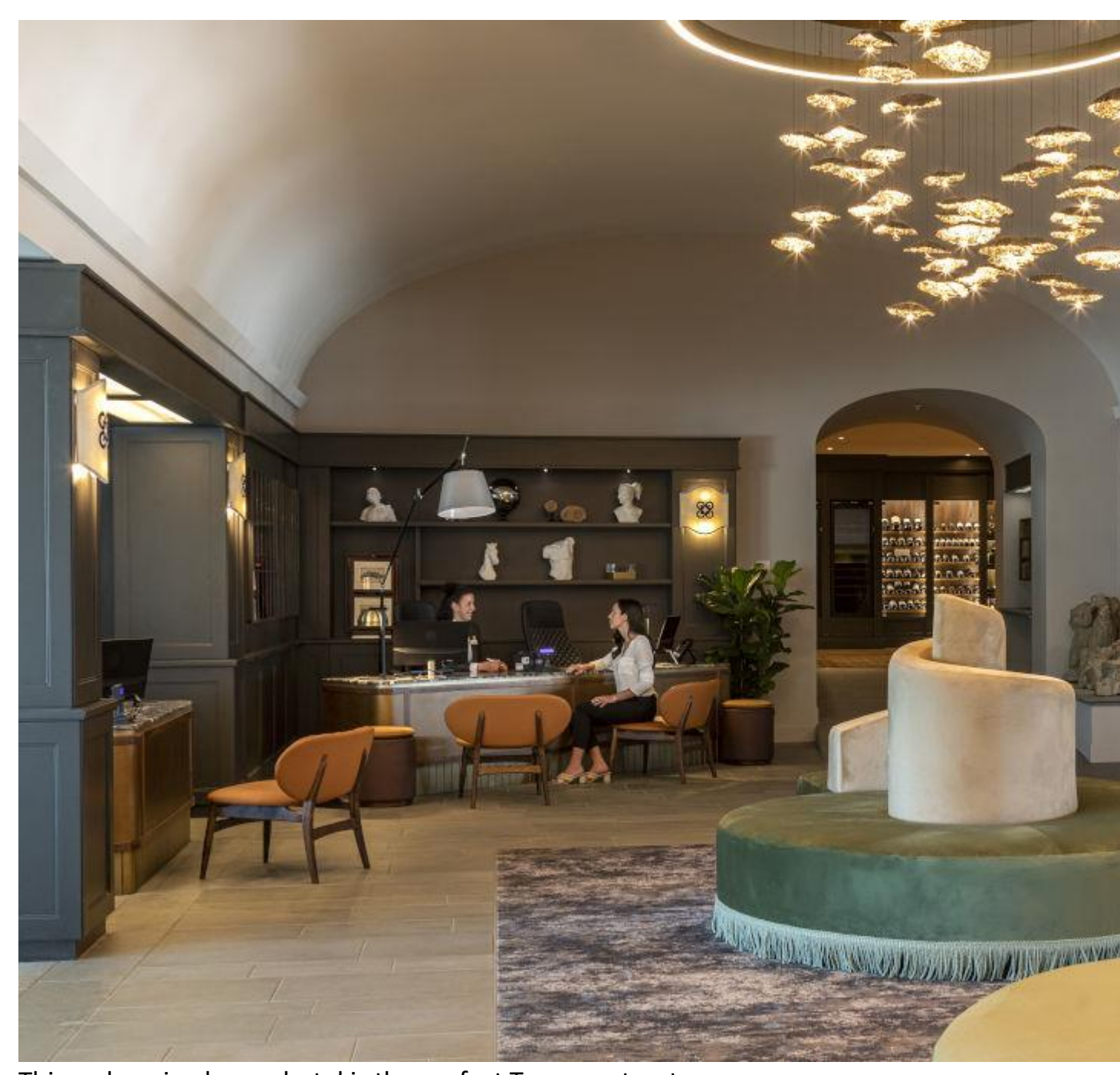
This welcoming luxury hotel is the perfect Tuscan retreat

Tucked away in the heart of rural Tuscany, just a 40-minute drive from Pisa airport, lies the beautiful Castelfalfi Estate in Montaione. Set within 2,700 acres of stunning surrounds, guests can truly immerse themselves in one of Italy's most visited and revered regions with a stay here.