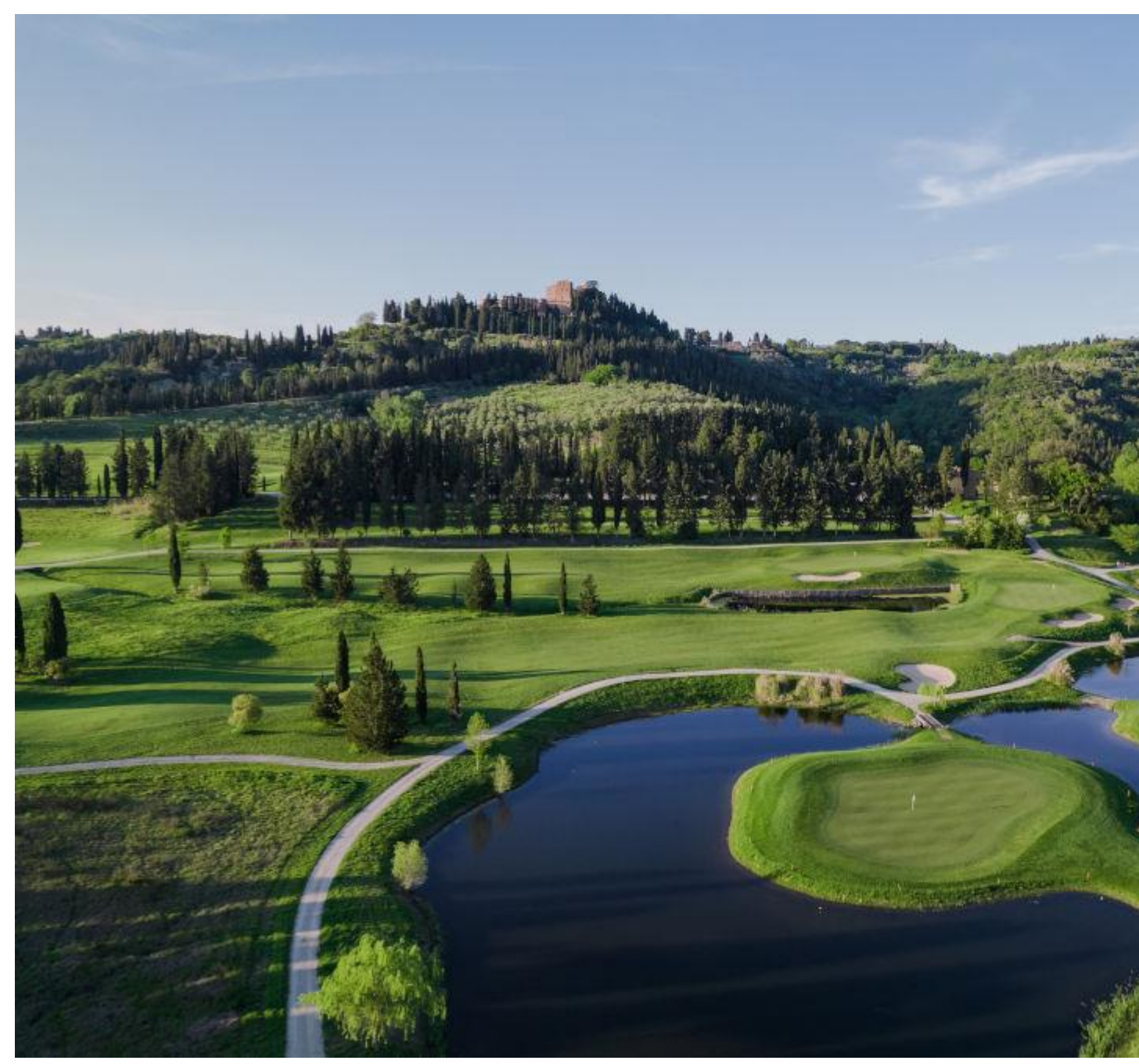
Castelfalfi Golf Club has over 9,400 metres of fairways, making it the perfect setting for golf lovers

If golf isn't your thing, there are also tennis and padel tennis courts on site, as well as archery, cycling, and personal trainers for those wanting to embrace a healthy lifestyle. There are also countless hiking options amongst the 2,700 acres of unspoiled nature, offering beginners and advanced hikers panoramic views over the vineyards, olive groves, rolling hills and Carfalo woods. Adventure seekers are covered with Vespa, supercar and quad bike rental options, whilst there's luxury shopping a stone's throw away within the village boutiques.