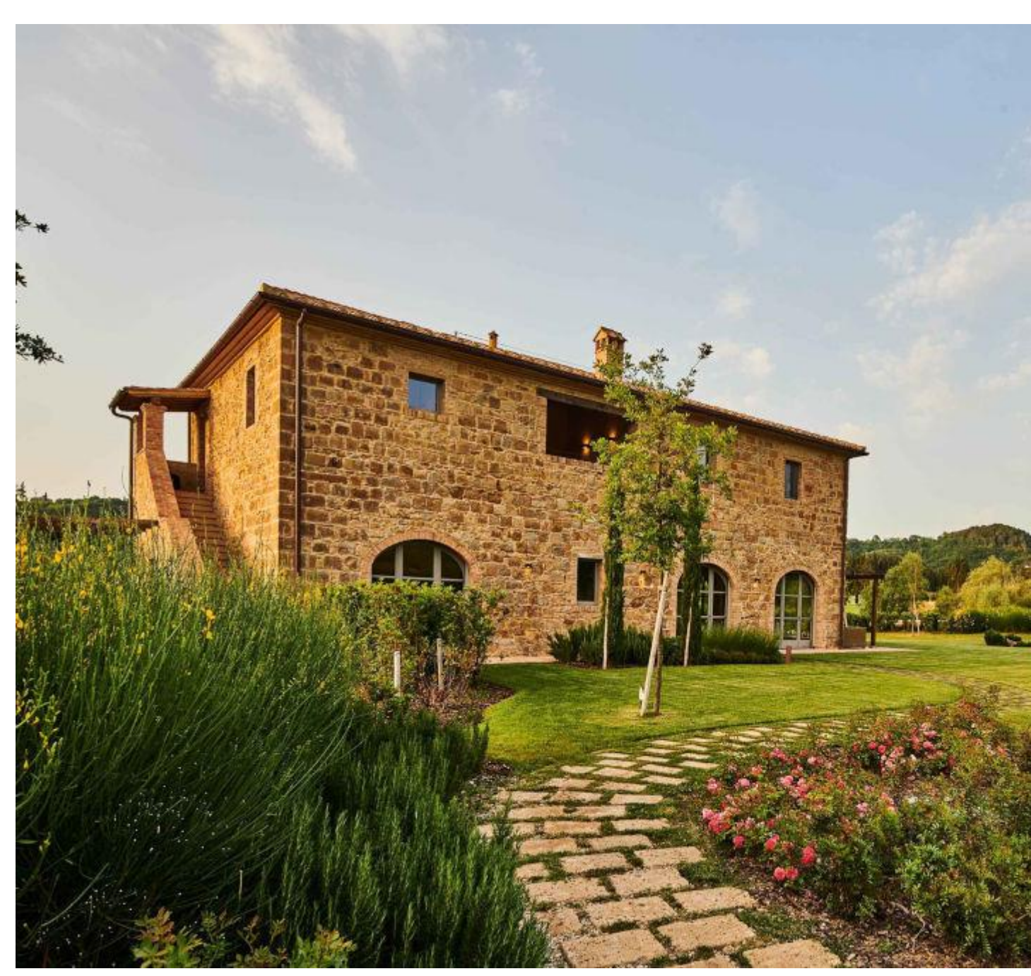
Accommodation includes Tuscan style villas and farmhouses With 146 rooms in total, there are 20 suites and four brand-new signature suites, which complete the final stage of the hotel's extensive renovation. Conceptualised with the renowned Affine Design, each signature suite features spacious layouts and breath-taking panoramic views over the rolling hills and vineyards, for guests to enjoy at their leisure within their private outdoor patio and garden.

For those wanting a more traditional Tuscan style, there are 31 rooms located in La Tabaccaia, the nearby historic tobacco warehouse, that have been carefully renovated to reflect the region's medieval history.